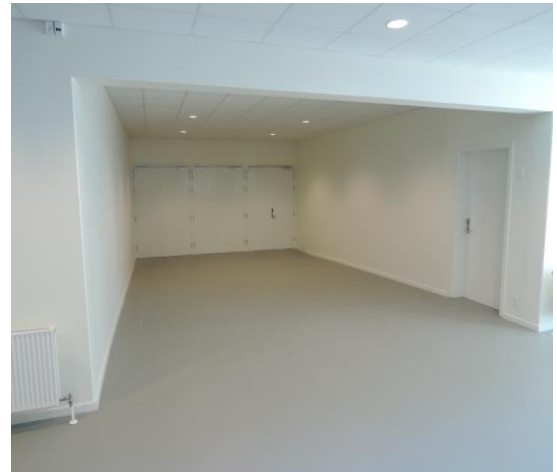
Call room and racket control room