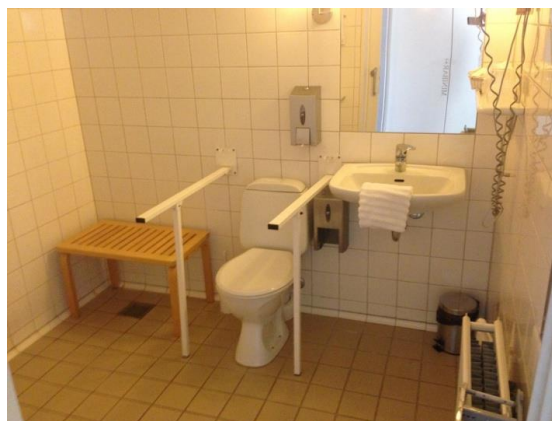
Wheelchair accessible toilette in Hotel Torvehallerne