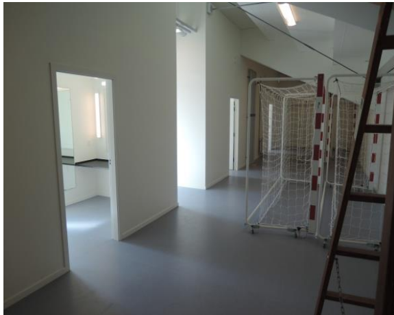
Doping control room and wheelchair storage